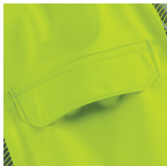
SAFETY Hidden access for harness straps.